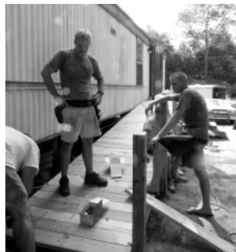
Members of the Church on the Eastern Shore take on the task of building a wheelchair ramp for an EMI client. We send our sincere thanks to these hardworking volunteers for a job well done.