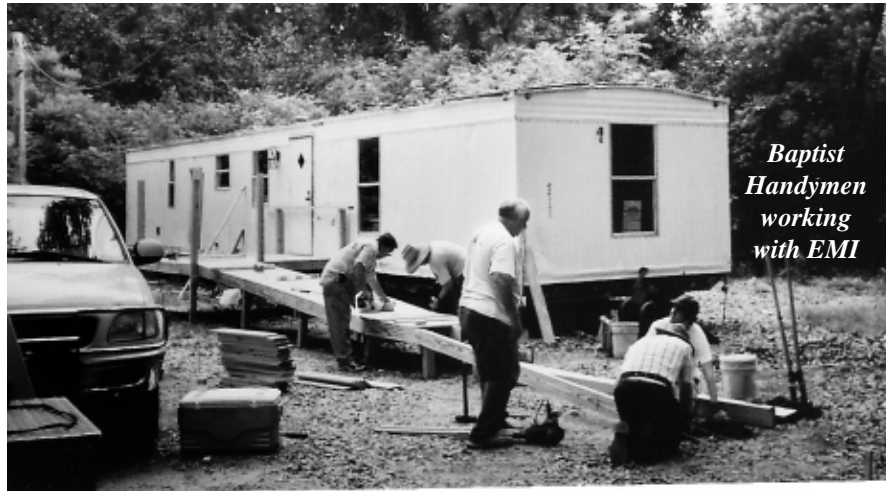
Baptist Handymen working with EMI