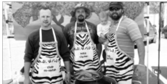
Riviera Utilities 2010 First Place

defend their title again this year while EMI is looking for other teams with great chili recipes to join the fun.