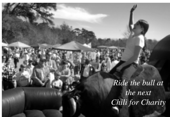
Ride the bull at the next Chili for Charity

Continued from front event. All proceeds help support the many social service programs of EMI. Winners of the cook-off, along with winners of