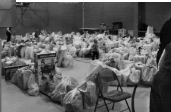
Top picture: Dale Sommerfeld & Dick Erwin (Foley); Picture at left: Jaline Bradley -- board member and volunteer working at distribution; pictured above, Fairhope distribution center